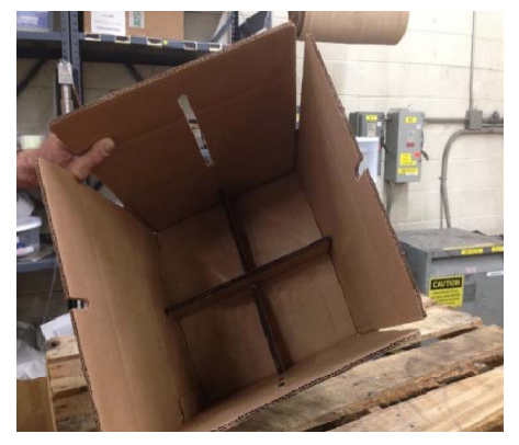
Cardboard Shipping Boxes

combustible dusts within the facility, SSC brought in New England Disposal Technologies to vacuum the overhead trusses and pipes. This improves worker health and safety as well as improving the general appearance of the facility. Seals were replaced in the forklifts to prevent hydraulic fluid leaks. Also, the forklifts were painted to make leak detection easier and improve employee morale by making the equipment aesthetically pleasing. To reduce excess packaging material that ultimately becomes waste, SSC uses specially designed shipping boxes that eliminate the need for a large amount of packaging plastic, foam, and absorbent material.