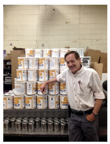
Audlee and STEEL-IT

Stainless Steel Coatings, Inc, a manufacturer located in Lancaster, MA, has been in business since 1974. Its