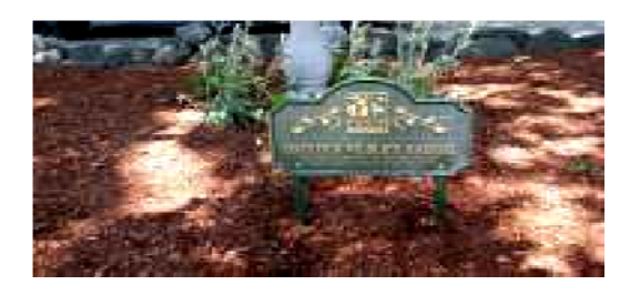
National Wildlife Habitat garden on SSC facility grounds

Management remains committed to involving all employees in decisions that affect them. It believes that a collaborative approach to problem-solving leads to optimal improvements because they are most likely to be implemented. According to Audlee: "In many companies, if management needs to make a change in policies or procedures, there is resistance and sometimes even sabotage from uninvolved, disinterested employees, who feel 'disconnected' from the program. We don't have that problem. We have people jumping in to help, offering suggestions, and working as a group who cares about the outcome." SSC's