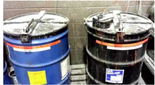
Waste Drums with One-Handed Covers

Corporation that can be operated with one hand to make it easier for workers to seal them. Also, to prevent solvent evaporation from paint vats while they are filled with raw materials but not in operation, production personnel experimented with different types of covers before deciding on one made of flexible plastic cover.